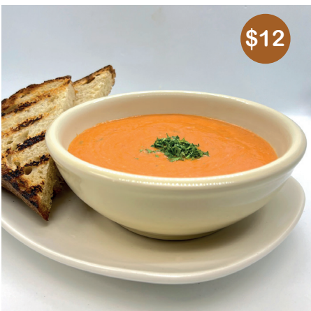
TOMATO BISQUE SOUP Tomato Puree, Cream, Roasted Red Pepper, Onion, Sourdough