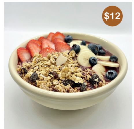
ACAI SUPER BOWL Blueberry, Strawberry, Banana, Granola, Honey, Roasted Coconut Mix Nut