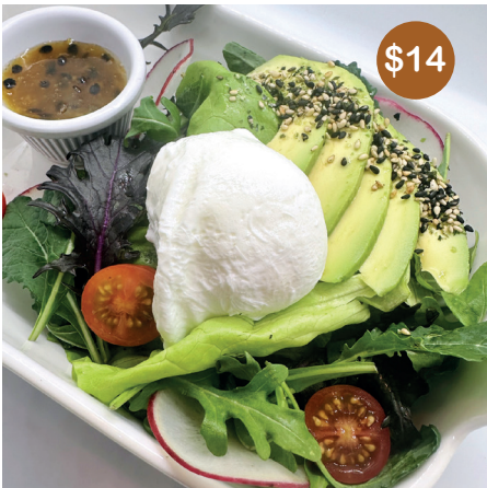
SUPREME SALAD Avocado, Poached Egg, Power Green Salad, Radish, Cherry Tomato, Nori Goma, Honey Passionfruit Vinaigrette