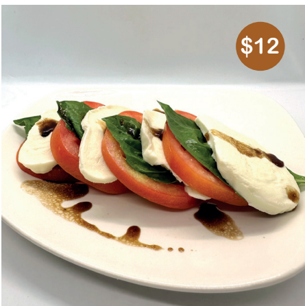
CAPRESE SALAD Mozzarella, Tomato, Sweet Basil, Olive Oil Balsamic Vinaigrette, Black Paper