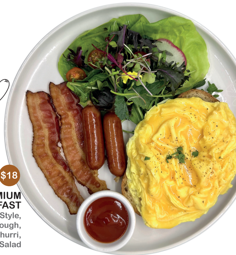
PREMIUM BREAKFAST Egg Any Style, Pork Sausage, Sourdough, House Made Chimichurri, Bacon, Green Salad