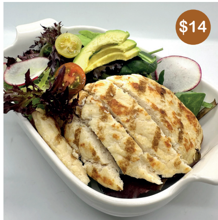
GRILLED CHICKEN SALAD Power Green Salad, Cherry Tomato, Radish, Avocado, Ginger Sesame Dressing