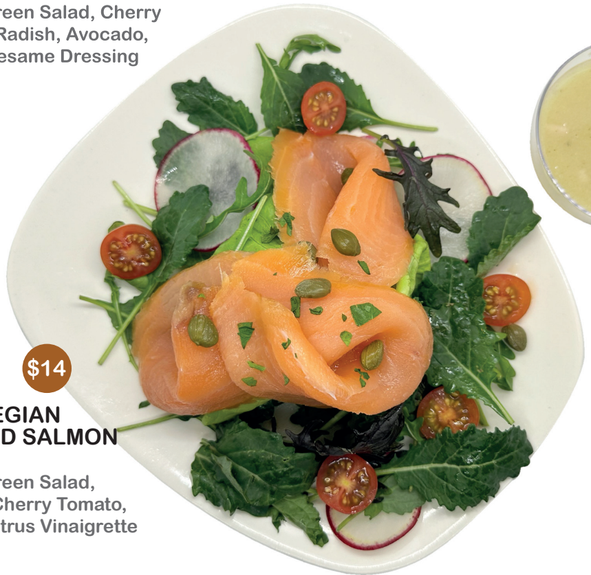
NORWEGIAN SMOKED SALMON SALAD Power Green Salad, Radish, Cherry Tomato, Caper, Citrus Vinaigrette