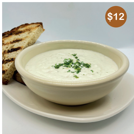
CLAM CHOWDER Chopped Manilla Clams, Potato, Mirepoix, Cream, Sourdough